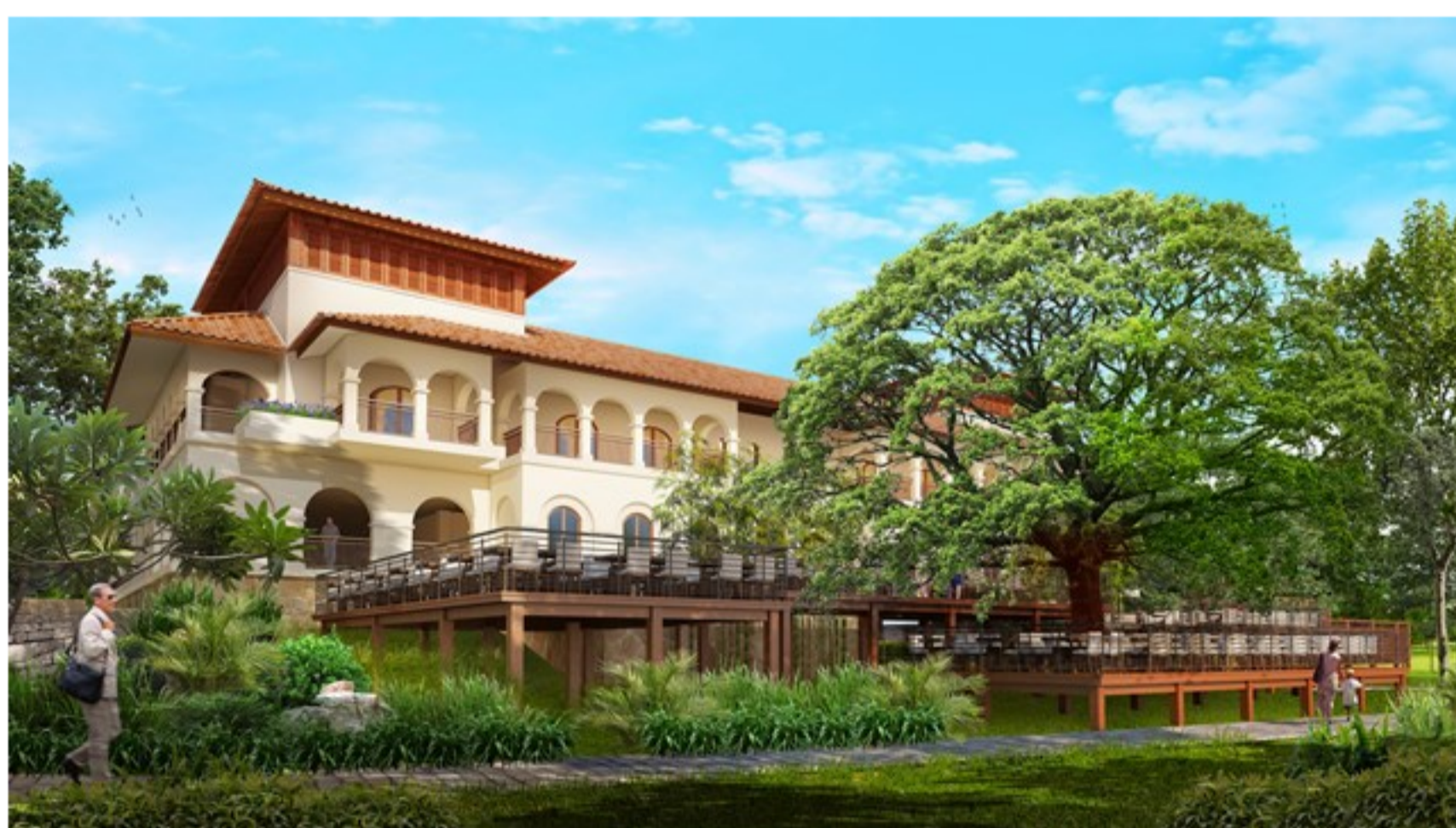
Sanctum Inle Lake Resort