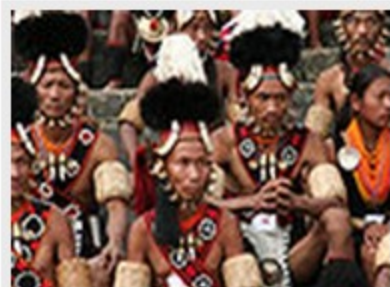
Pandaw Announces New Myanmar Itinerary Feb 25, 2015