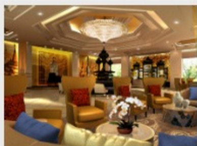
Opening in Myanmar: Kempinski Hotel Nay Pyi Taw Nov 14, 2014