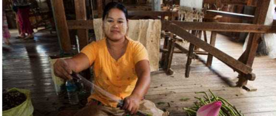
Bedroom at the Sanctum Inle Resort.

Overnight in chic, minimalist rooms at the upscale Sanctum Inle Resort (Maing Thauk Village; +95 92 52818805). The architecture blends monastic-style Gothic-inspired with Asian luxury. The Sanctum Spa offers a spectrum of relaxing treatments. The balcony of the resort's Refectory restaurant, where you can sample dishes inspired by the region's Shan cuisine, overlooks the lake.