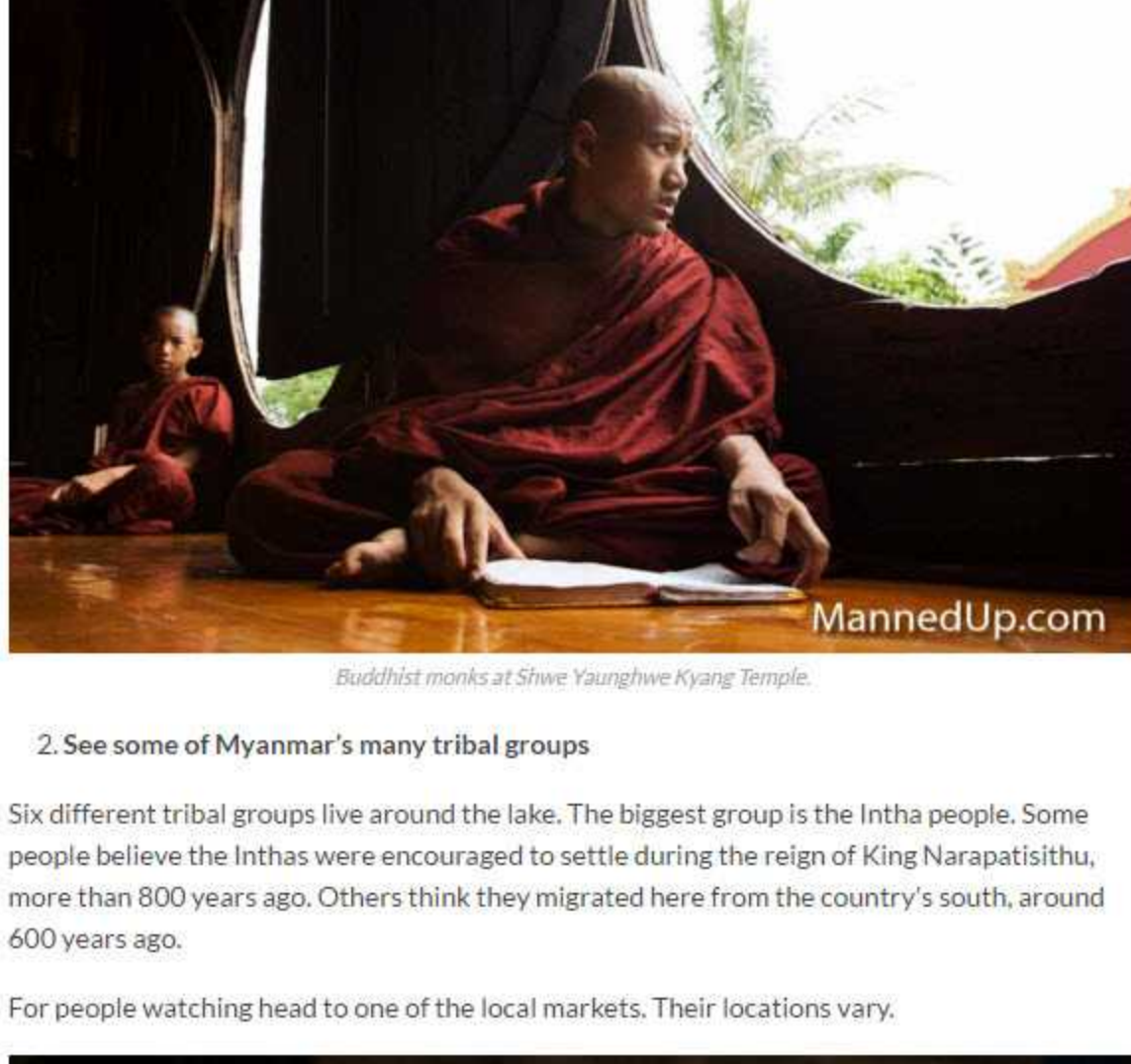
Buddhist monks at Shwe Yaungthwe Kyang Temple.

The road journey from Heho to Inle Lake takes 45 minutes. Allow additional time for a stop at Shwe Yaungthwe Kyang Temple. The Buddhist place of worship was established around 800 years ago. The teak temple now at the site dates from the 19 th century – a fire destroyed its predecessor. It's a great place for photographing monks and novices.