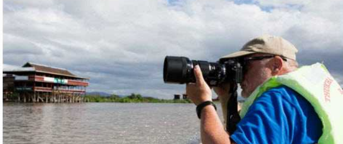
A tourist with a camera on Inle Lake.

The Shan Mountains rise above Inle Lake, providing a dramatic backdrop for landscape photos. The hues of the mountain slopes change throughout the day, making it a rewarding place to spend time with a camera.