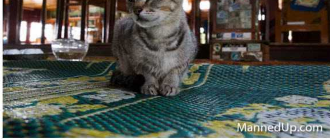
Local people in a boat on Inle Lake.

Ongoing reforms to Myanmar's governmental structure mean, increasingly, travellers see the country as a viable tourism destination. Will an influx of travellers bring change? Most probably, Now is the time to travel there if you want to observe traditional ways of life.