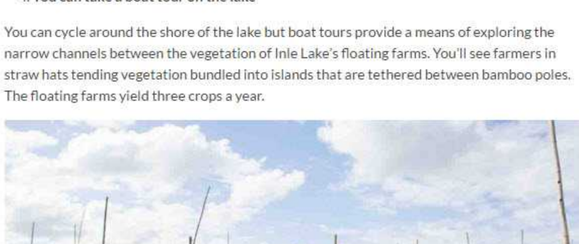
A floating farm on Inle Lake.

You can cycle around the shore of the lake but boat tours provide a means of exploring the narrow channels between the vegetation of Inle Lake's floating farms. You'll see farmers in straw hats tending vegetation bundled into islands that are tethered between bamboo poles. The floating farms yield three crops a year.