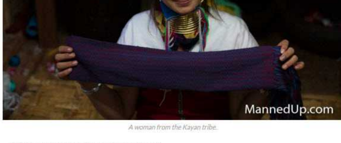
A woman from the Kayan tribe.

For people watching head to one of the local markets. Their locations vary.