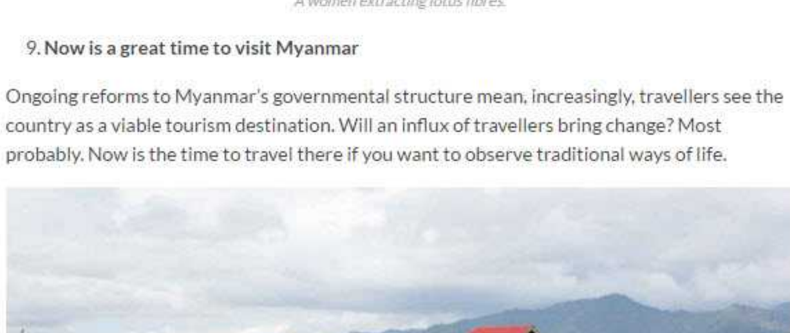
Buddhist pagoda in Phaung Daw Oo pagoda.

Inle Lake is at an altitude of 880 metres above sea level meaning it can be visited throughout the year, even during Myanmar's hot summer season from March to May. In the rainy season, from June until October, the region receives intermittent, sometimes heavy showers.