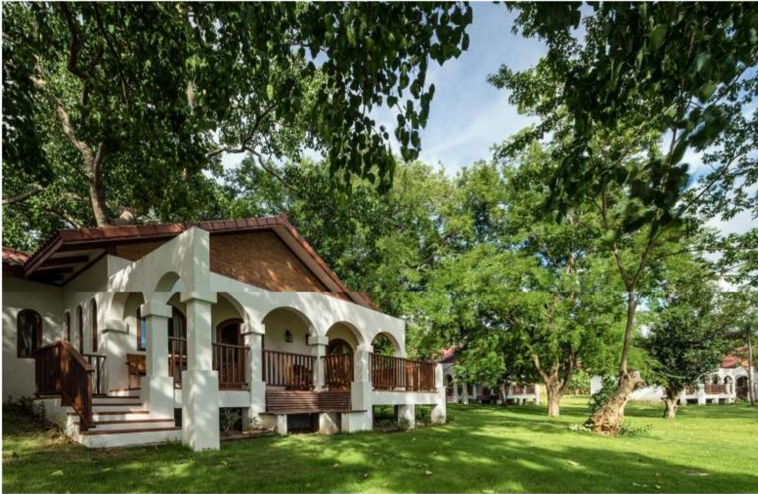
A junior suite at Sanctum Inle Resort, the first upscale hotel on the shores of Inle Lake in Myanmar, which opens on Oct 1.