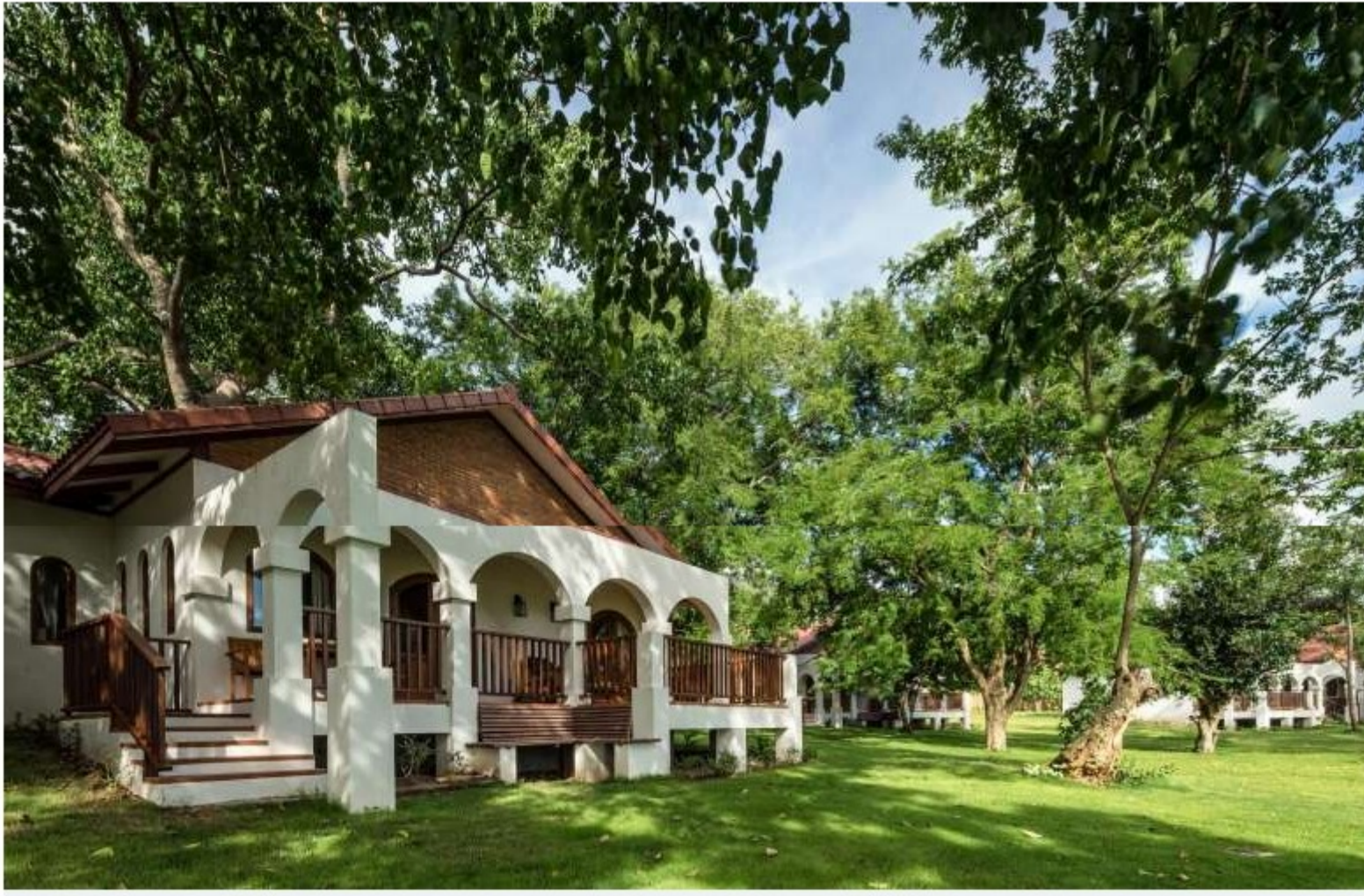
A junior suite at Sanctum Inle Resort, the first upscale hotel on the shores of Inle Lake in Myanmar, which opens on Oct 1.