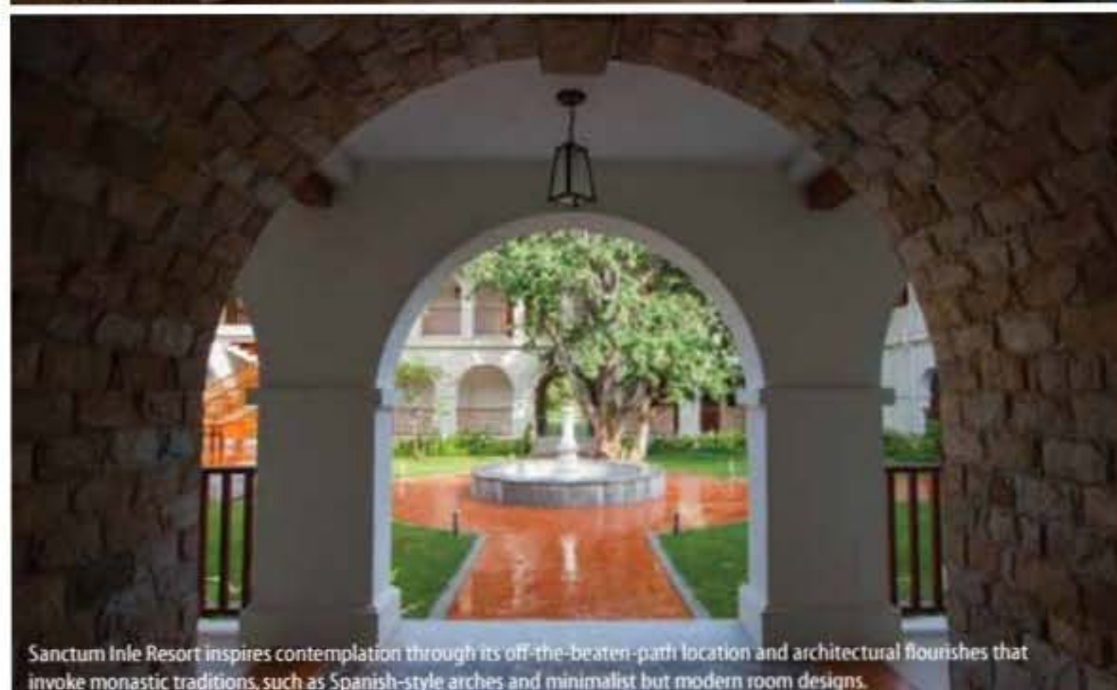
Sanctum Inle Resort inspires contemplation through its off-the-beaten-path location and architectural flourishes that invoke monastic traditions, such as Spanish-style arches and minimalist but modern room designs.