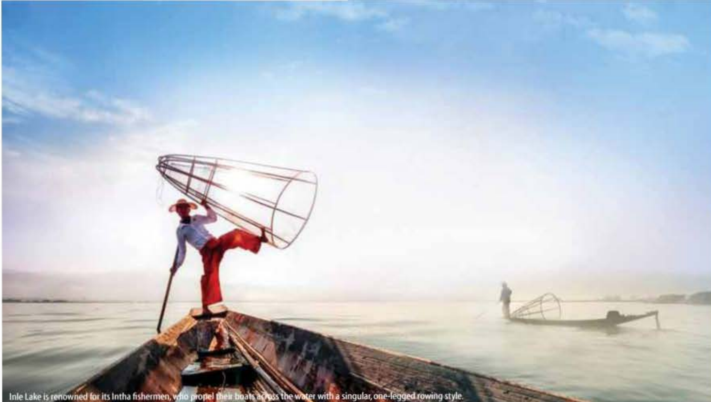
Inle Lake is renowned for its Intha fishermen, who propel their boats across the water with a singular, one-legged rowing style.

of Myanmar-brewed beers, international wines and Cuban and Dominican cigars. The resort's Chapter House is a quiet venue with books and board games that can be transformed into a meeting space.