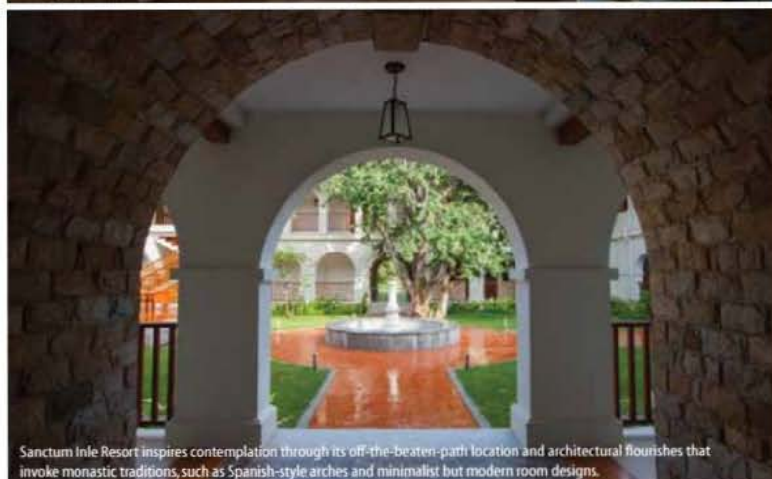
Sanctum Inle Resort inspires contemplation through its off-the-beaten-path location and architectural flourishes that invoke monastic traditions, such as Spanish-style arches and minimalist but modern room designs.